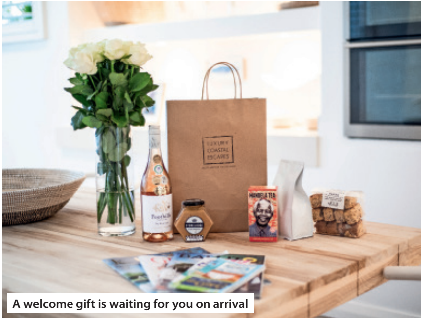
A welcome gift is waiting for you on arrival